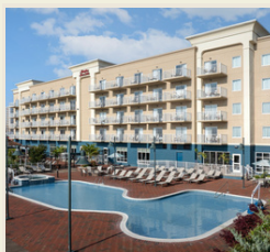
Hampton Inn & Suites Ocean City Bayfront Convention Center

The Hampton Inn & Suites Ocean City Bayfront Convention Center is proud to announce the completion of a full-property renovation, bringing a refreshed coastal charm and elevated guest experience to one of Ocean City's most convenient locations. The transformation includes modernized guest rooms and suites, an updated lobby and breakfast area, and enhanced outdoor spaces overlooking the bay. With its ideal setting adjacent to the Roland E. Powell Convention Center, the hotel now offers an even more inviting atmosphere for business and leisure travelers alike—combining comfort, style, and the signature Hampton hospitality guests love.